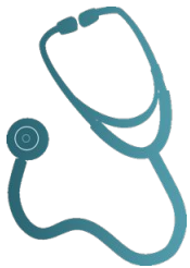
Preventable & Treatable Illnesses

AMOS now works in the Nicaraguan departments of Matagalpa, Chinandega, Boaco, and the RAAS, serving over 13,000 people.