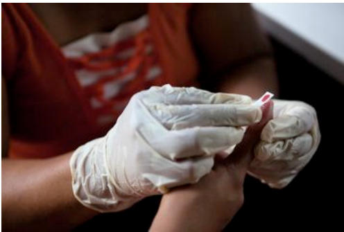
Health Promoter Timotea of San Onofre testing a child for anemia.

Anemia is a major global health issue, affecting nearly two billion people worldwide. The good news is that anemia is preventable and easily treatable, but first, it must be diagnosed. This year AMOS was able to test over 1,347 children and 82 pregnant women in 2011 for anemia. Up to 60% of the children we tested had anemia compared to 20% of the rest of Nicaragua because children in poverty don't get enough iron rich foods. AMOS now provides iron supplements and follow up to children with anemia.