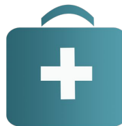
Access to Health Care