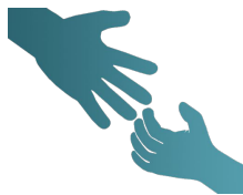
Service to the Most Vulnerable